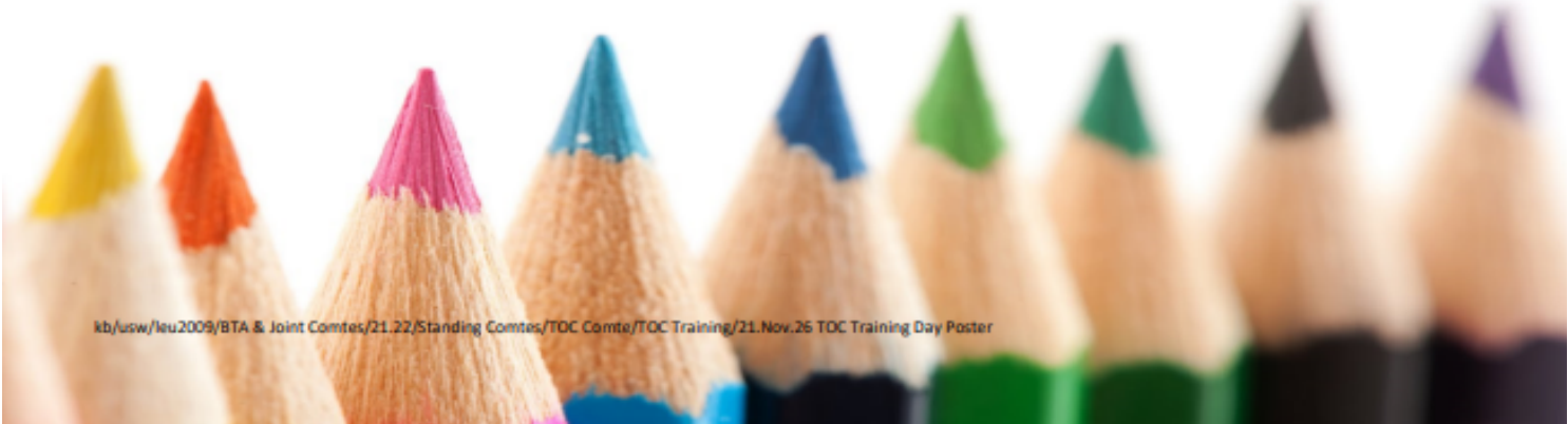
kb/usw/leu2009/BTA & Joint Comtes/21.22/Standing Comtes/TOC Comte/TOC Training/21.Nov.26 TOC Training Day Poster

Registration will be on a first come first served basis for qualified attendees, for up to 40 attendees. You must register by no later than Friday, November 19, 2021 by noon to obtain a spot, as seats will fill up quickly.